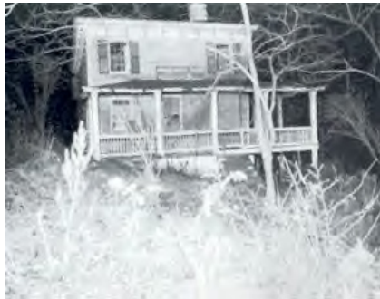
Wisteria cottage , where Albert Fish murdered Grace Budd.